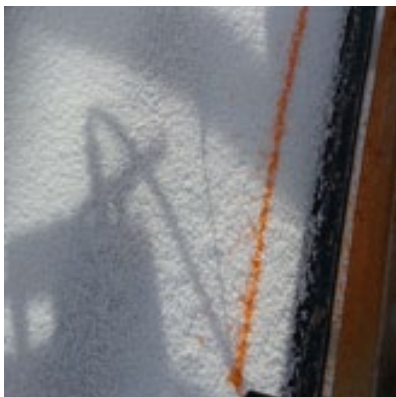
Treating Arm U™ on to moving belt of urea